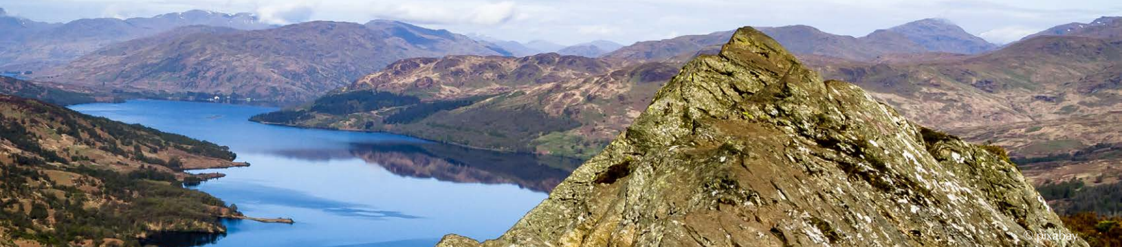
Loch Lomond & The Trossachs National Park

For questions, and to reserve your space, contact Eos Study Tours: 800-856-8951 or email eos@studytours.org