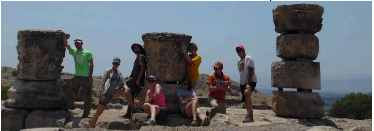
The Omrit team strikes a pose at the conclusion of a good, long day in northern Israel.

An article about experience of one Omrit participant, Ben Shields, appears on the Macalester College web site here: http://www.macalester.edu/news/2015/12/learning-in-israel/