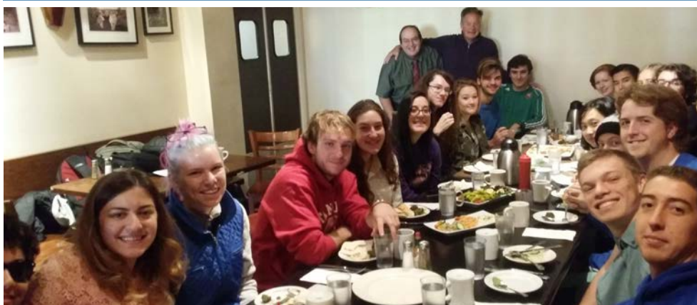
Arabic breakfast at Shish.