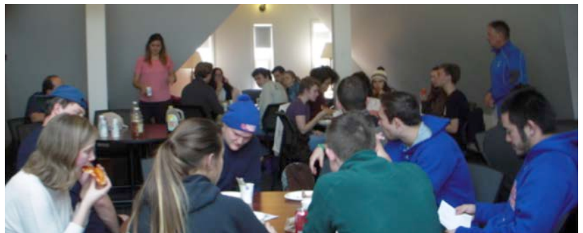
Above: November 11 lunch for majors, minors, faculty and friends of the Classics Department.