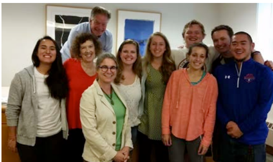
Above: Some of the participants from the 2014 "January in Rome" class enjoyed a mini-reunion at the Classics Department's September "Welcome or Welcome Back to the Classics Department!" lunch.

http://www.stoa.org/diotima/anthology/cat64.shtml