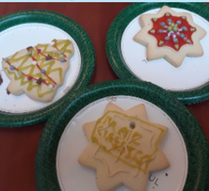
Below: Cookies from the party, including one "Mac Classics" one.