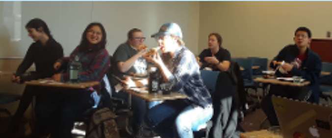
Above: Students enjoying pizza at the Pre-registration Lunch

The fun will start right back up in January with a group of twenty professors and students traveling to Rome for January in Rome.