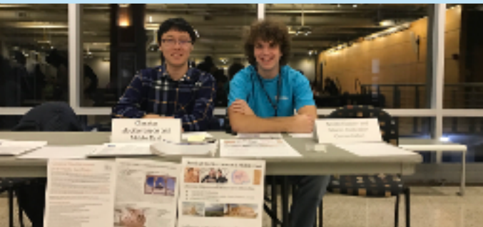
"C" is for Classics Cookie Party!