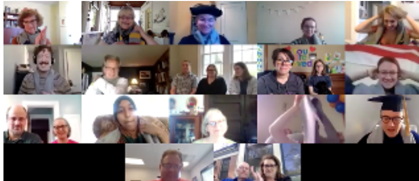
At right: Classics graduates and department members, participate in the Scarving Ceremony, while the graduates guests look on.