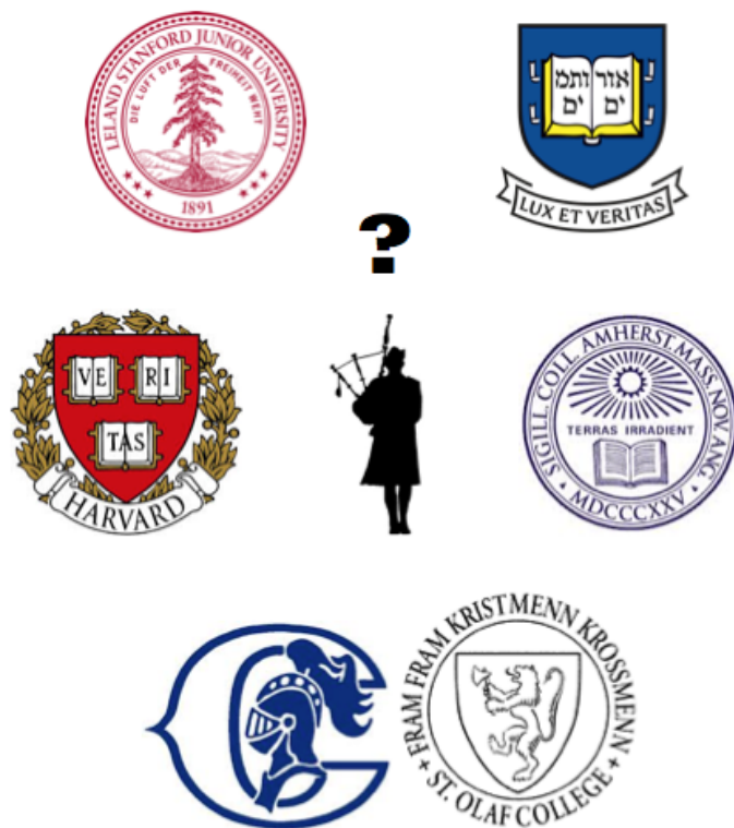
Figure I: Case Studies of Other Higher Educational Institutions

Various higher educational institutions have implemented sustainability in their special events such as graduation ceremonies and reunions. Although Macalester College is known for its commitment to sustainability and its students are generally passionate about environmental issues, there are examples of efforts made in some other colleges that we can learn from in generating our own proposal.