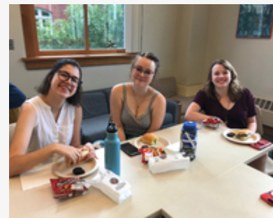
Students and Faculty enjoying sandwiches and fun conversation at the Fall Majors Lunch