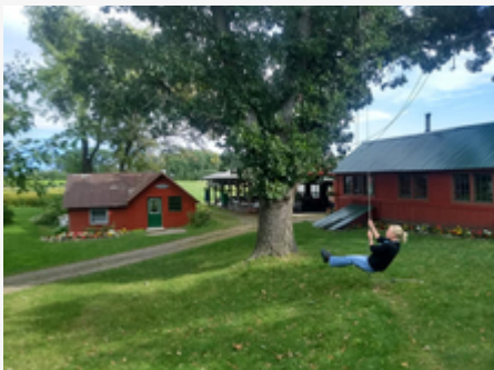
People, Agriculture, and the Environment visited Common Harvest Farm in Osceola, WI