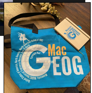
Trivia prizes included geography tote bags and notebooks