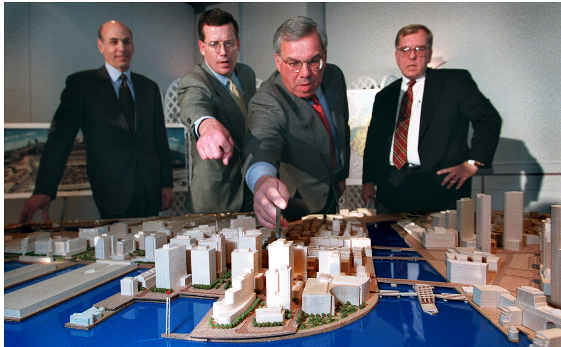
Former Boston Mayor Menino standing over a mockup of the Seaport Redevelopment Plan 31

morality of their strategies. The city used tax breaks to promote growth in the Seaport District, offering generous packages to the likes of pharmaceutical corporations and banking behemoths like J.P. Morgan. The practice of using tax incentives to tempt businesses into relocating is a controversial practice given that it often uses taxpayer dollars and has few empirically proven benefits. Researchers found that tax breaks are often given to businesses that would have selected the same location regardless of incentives, and have little impact on a firm's profitability given that property taxes comprise such a small percent of expenditures. Additionally, the widespread use of tax incentives across major cities reduces the overall effectiveness, ultimately depleting the tax base without promoting economic development.