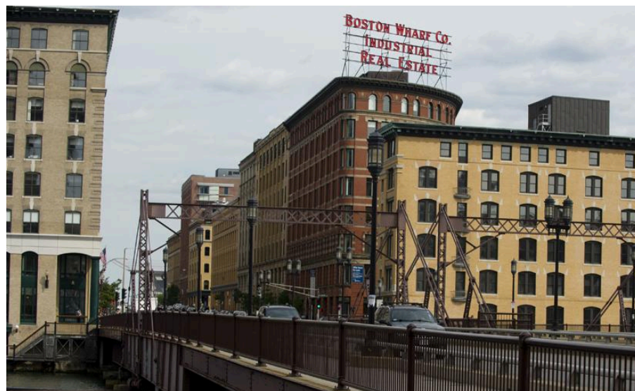
View from the Summer Street bridge while crossing into the Fort Point Channel Historic District 40

Economic development instruments like property tax breaks or tax increment financing not only have questionable results, but can also be the source of blatant corruption and mismanagement of funds. In the case of Boston, the development of the Seaport District has seen several bribery scandals come to light in recent years, relating to ongoing business ventures in the area. In 2021, a state representative was sentenced to fifteen months in federal prison for accepting almost $30,000 in exchange for fast tracking legislation that would provide millions of additional dollars in tax credits for developers wishing to develop property in the Seaport District. 39 In 2020, a city hall aide admitted to accepting bribes for helping a developer extend their permit for a condominium development in the neighborhood. Both of these cases were headline worthy scandals, but they were not isolated cases. Complicated public-private partnerships create a perfect atmosphere for businesses to take advantage of city officials, and the complexity and longevity of these projects yields itself to the misappropriation of funds. The redevelopment of the Seaport District has, in fact, prompted a city wide investigation into Boston's current development procedures. While this investigation is commendable and could result in more equitable and transparent practices, it's unlikely that private corporations won't continue to have undue influence on urban development projects.