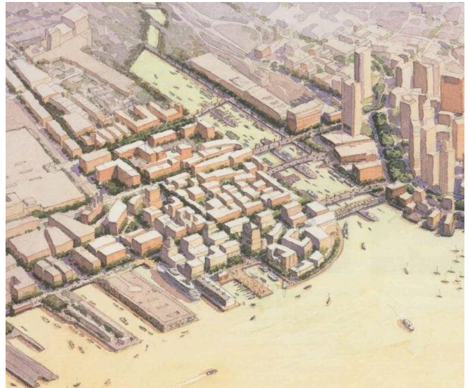
A rendering from Boston's 1999 Seaport Public Realm plan 24

In terms of walkability, the higher density of development lends itself to pedestrian access. On the other hand, the large sidewalks that accommodate masses of tourists accompany wide roads that encourage automobile usage. Despite being so close to downtown, over 40% of residents use a car as their primary form of transit, while in other neighborhoods the mode share is closer to 15% or 20%. 23 High automobile usage is understandable in more suburban neighborhoods that developed alongside the highway system. For an area like Seaport, which was constructed largely in the twenty-first century, and is within walking distance of the financial district, such a high car mode share seems antithetical to Seaport's pedestrian friendly mission.