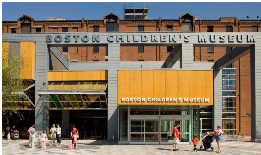
View of the Boston Children’s Museum, with the former warehouse in the background and modern addition in the foreground. 42

In a time where office vacancy rates are still much higher than the pre-COVID-19 levels, converting these offices to new residential spaces could have a significant impact on a housing strapped city. Especially as redevelopments fall through—like General Electric’s short lived new headquarters—it might be time to reconsider the land use priorities for existing warehouses and empty lots. There have been several instances of historic offices or warehouses in Boston that have been converted to commercial use and then ultimately converted to residential space. There is a model for this transition, and adopting a more fluid perspective towards land use in downtown areas will be increasingly important for the resiliency of American cities. There are indeed some engineering challenges to these types of conversions, but at the very least, this indicates that new construction should take into account a range of uses that might occur in a building’s lifetime. Added flexibility is rarely a detriment to the function of the built environment, and adaptive reuse can not only be seen as a renovation but an improvement to a building’s adaptive capabilities.