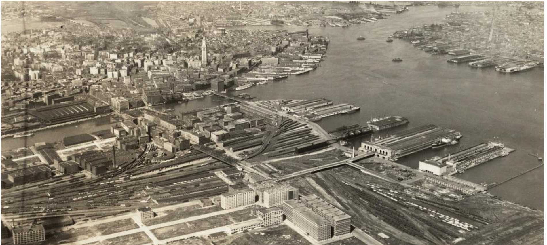
Aerial photograph of the South Boston Waterfront in 1925 10

them empty and unused. North of this was a collection of sprawling surface parking lots and abandoned parcels of land that had been home to various fishing and light manufacturing industries. For about a decade from 1955 to 1965, the area became a blighted wasteland between the central business district and the remainder of South Boston. Despite occupying some of the best real estate in the city, the Seaport District was home only to a few seedy establishments that were popular among Boston's mob scene. Gradually a few seafood restaurants and nightclubs opened their doors, bringing initial attention to the otherwise overlooked neighborhood.