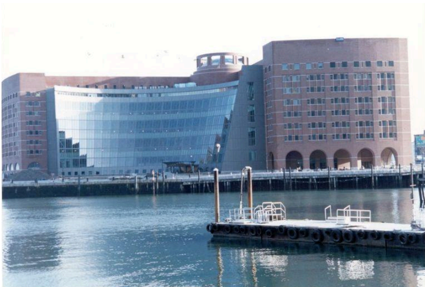
View of the John Joseph Moakley Courthouse from Rowe's Wharf, 1998 15

“Harbor of Shame” by former President George H.W. Bush. 13 The initiative was driven by the Clean Waters Act of 1972, and aimed to make the harbor not just a site for fishing and commerce but also for nature and recreation. The decades-long project was generally seen as a success and has been lauded as transformational for the city of Boston by environmentalists and politicians alike. 14 Additional public investments in the South Boston neighborhood included a new federal courthouse on Fan Pier which opened in 1998, and a new convention center on Summer Street, which broke ground in 1997. The parcel occupied by the convention center was also unsuccessfully floated as a new location for a sports complex that would be the new home for the National Football League’s New England Patriots. Several key infrastructure investments created a new cultural and transit landscape in the Seaport District for developers to expand on. The location of the convention center in what had recently been a seedy, industrial area helped legitimize the neighborhood as a hub for arts and exhibition, building off of Fort Point’s status as a creative district.