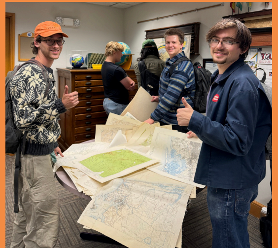
Geographers examining maps during this year's geography open house! Food and vibes were shared.