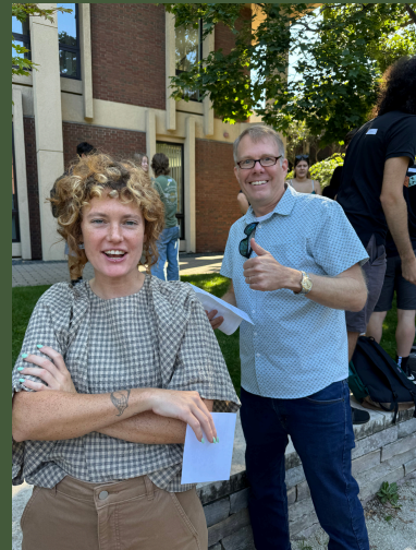
Students and faculty kick the year off right with the traditional fall semester geography lunch!