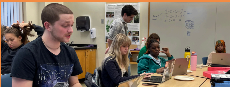
Macalester Geography students map out households in rural Afghanistan to help Médecins Sans Frontières with their lifesaving mission

This semester Macalester Geography continued its longstanding tradition of hosting a mapathon where students contribute their time to helping Doctors Without Borders (MSF) map rural and under-served locations, with the aim of expanding healthcare access to those communities.