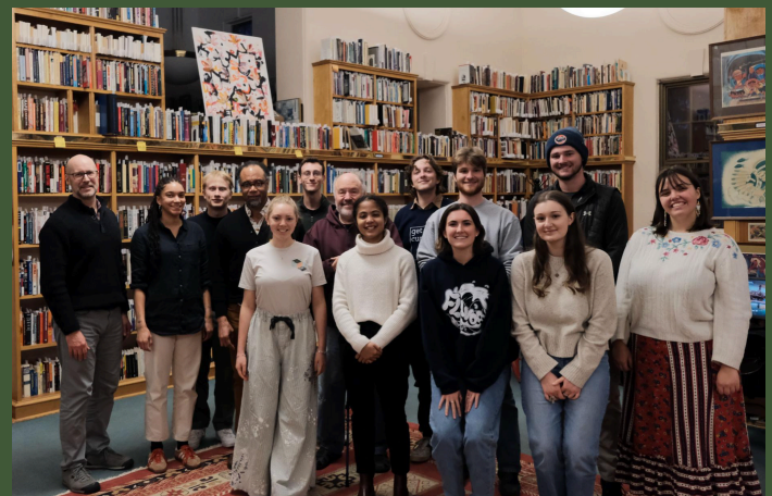
Qualitative Research Methods Students