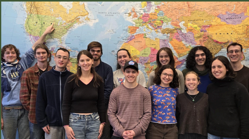
Urban GIS Students

Students in GEOG 277 "Qualitative Research Methods in Human Geography" spent the semester engaging in collaborative research with East Side Freedom Library. On Tuesday, December 10, they presented findings from their project to members of the library's staff. Check out their impressive work at this link: Payne Avenue Walking Tour - Building Tomorrow: Community Investment and Resilience Across Time.