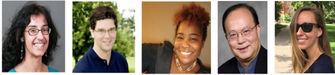
Celebrate New Books by Macalester Historians