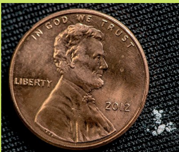
A lethal dose of fentanyl