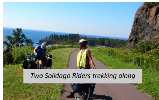
Two Solidago Riders trekking along

And with all this it may be needless to add that we expect to be home and back in Saint Paul by sometime next week. See you soon, Minnesota!