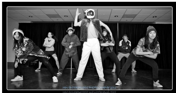
Visceral, at the Bodacious Showcase.