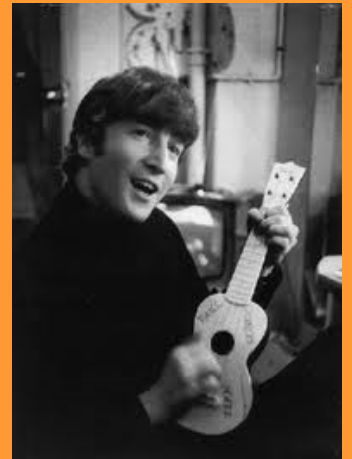
John Lennon Oct. 9th 1940-1980

October 31st: John Keats 1795-1821 English Romantic Poet