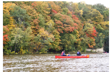
"...hundreds of trees caught in moments of vulnerability and beauty..."

After getting back into the canoes, our group headed for Fort Snelling, where we loaded the canoes back onto Jon's trailer, and then hiked up to find our bikes. We had a short, relaxing ride back to Ping's. At Ping's we bonded, reflected, and perhaps most importantly, rested, as we listened to music and prepared dumplings. Ping made a dinner to die for. Love and trust filled our bodies and spirits, as did dozens of dumplings (each), rice, fish, mushrooms, tofu, and vegetables. We returned to Macalester full, changed, and inspired.