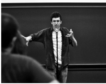
(from page 1)