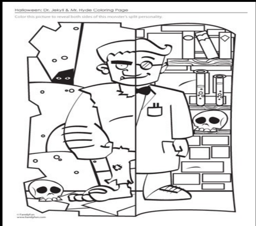
Halloween: Dr. Jekyll & Mr. Hyde Coloring Page Color this picture to reveal both sides of this monster's split personality.