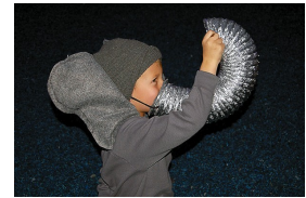
..there have been books with elephants...