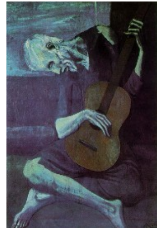
"The Old Guitar Player" -Picasso 1903

"Heard melodies are sweet, but those unheard are sweeter."