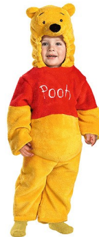
Tons of books on this guy, being a child underneath is optional.