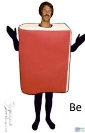
Be a book.

For those of us who struggle with lit-themed dressings